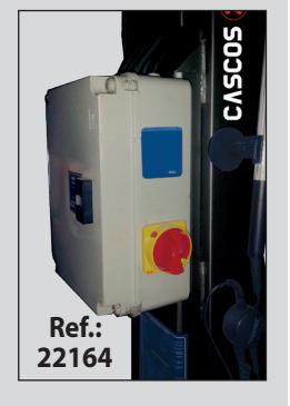
Integrated power plug Assembled in factory